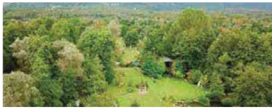
Sapanca Nature Park : 8 km