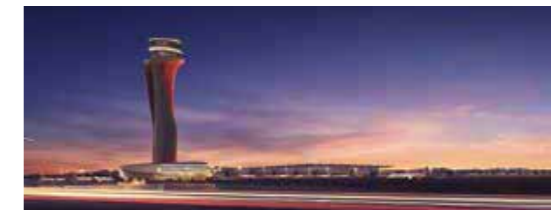
Istanbul Airport : 166 km