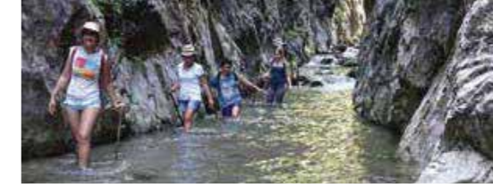
Serindere Canyon : 39 km