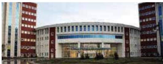
Sapanca District State Hospital : 8.5 km