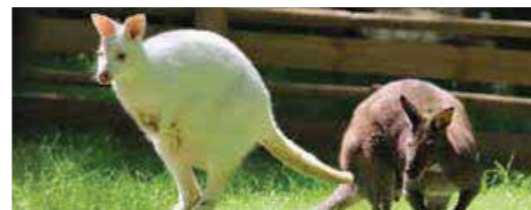
Children's Zoo : 14.5 km