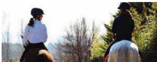
Natura Sapanca (Horse Riding, Canoeing, ATV, Paintball, Trekking) : 8,5 km