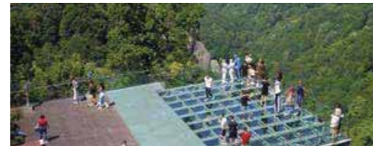
Ayrı Gezegen Glass Terrace : 17.5 km