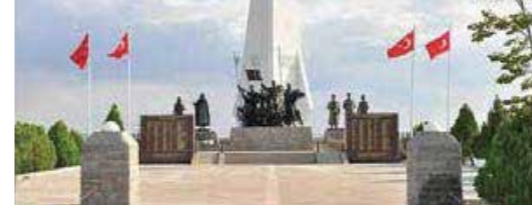
Sakarya National Park : 13.5 km