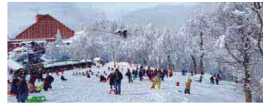
Kartepe Ski Resort : 23 km