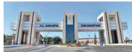
Sakarya University : 29.5 km