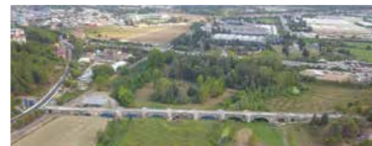
Justinian Bridge : 25 km