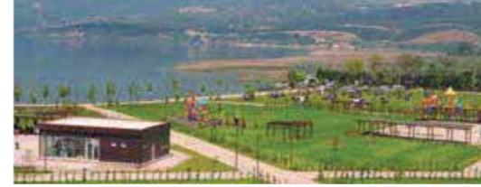
Golbasi Picnic Area : 15 km