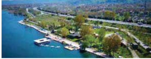
Kirkpinar Beach : 6.5 km