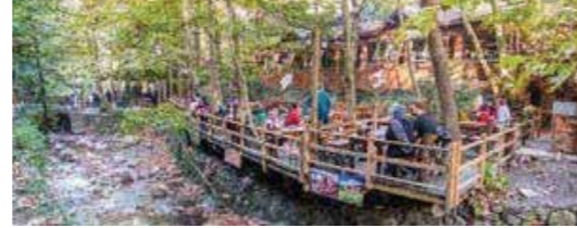
Mashukiye Recreation Area : 10.5 km