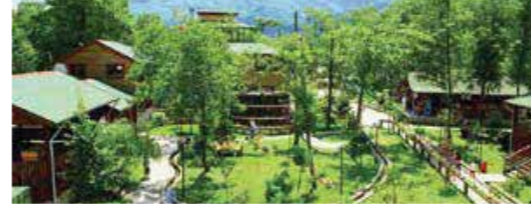
Mashukiye Trout Facilities : 11 km