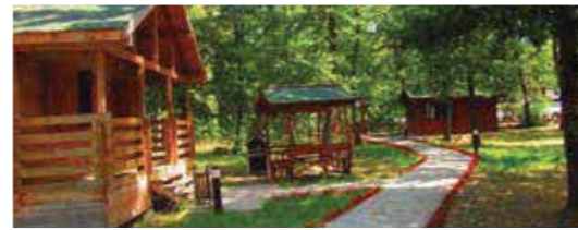
Sakarya Provincial Forest Nature Park : 14 km