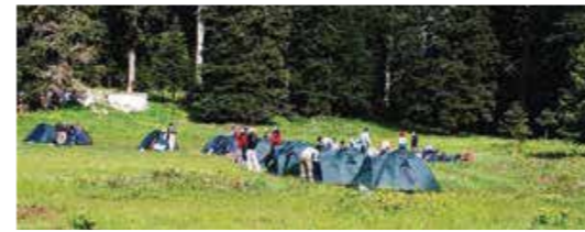
Kuzuyayla Nature Park : 24 km