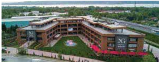
NG Sapanca Bedesten Shopping Mall : 6 km