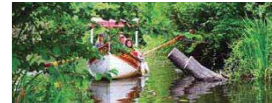
Acarlar Floodplain : 90 km