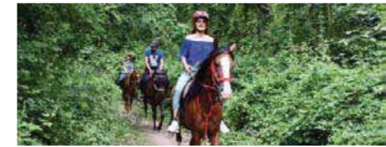
Kartepe Horse Farm : 12.5 km