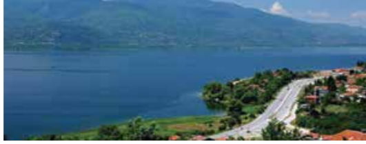
Sapanca Lake : 3 km