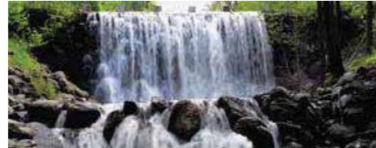
Mashukiye Waterfall : 11.5 km