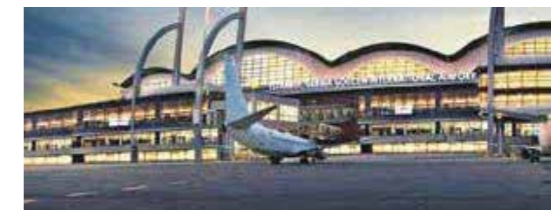
Sabiha Gokcen Airport : 85 km