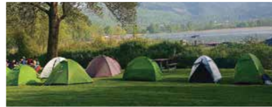
Seka Camp Picnic Area : 13 km