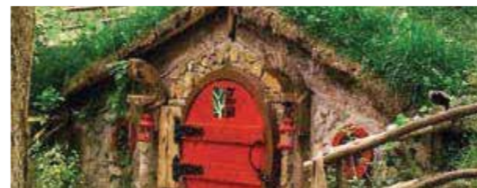
Ormanya (Forest Park) : 14.5 km