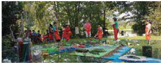
Orange Blossom Art Colony : 5 km