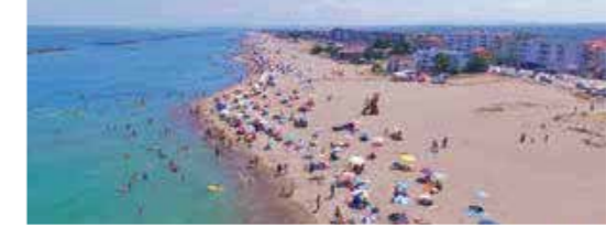
Karasu Beach : 83 km