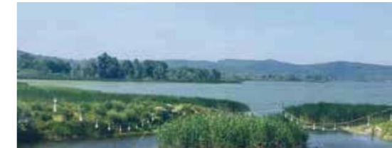
Golkent : 65 km